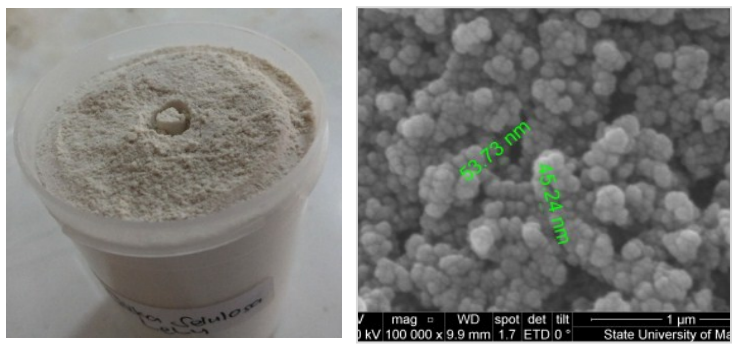
Figure 1. The appearance of silica-cellulose material (left) and the SEM picture of the same material at 80.000 times magnification

The SEM picture of the material showed the porous structure of the gel which are globular and reach dimension below 100 nm. The globular shape of the gel granules implied the homogeneity of sol-gel processing which ensured good pore size distribution. This is a desired property of the good adsorbent material for separation purposes. The cellulose particles on silica surface cannot be distinguished clearly and this is also a good sign of physical interaction between silica and cellulose.